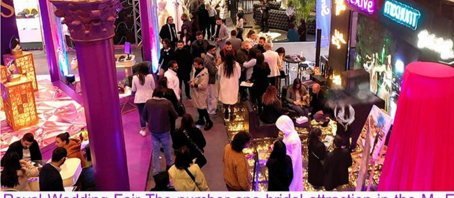
Royal Wedding Fair The number one bridal attraction in the M. E